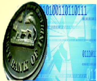
LAN, WAN, WI-FI BANKS, CREDIT CARD